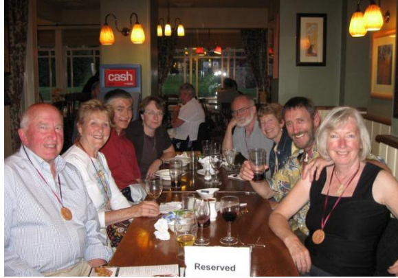
As "crew-mates" we become very close ... in more ways than just being on a boat!

Whilst our boats are certainly comfortable (and the very best available), space will be at a premium. In order to keep things running smoothly it is not our intention that many meals be prepared on board. A comprehensive bill of breakfast fare (coffee, tea, milk, OJ, breads, muffins, eggs, cereals, snacks, etc.) will be available for self-service (including dishwashing!). Snack lunches will be supplied on the same basis. Each morning a shopping list will be prepared, to top-up our supply of comestibles. Should anyone have special dietary requirements you will be taken grocery shopping so that you may have whatever you require to hand, in order prepare your own meals.